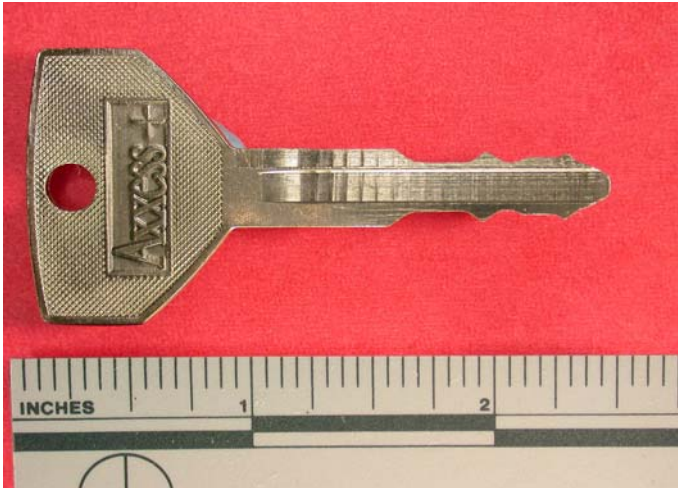
#17 Axxess+ Chrysler Key Blank