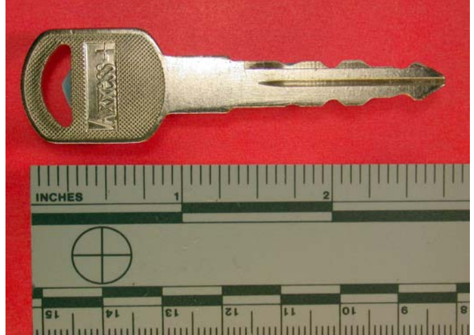
#14 Axxess+ GM Key Blank

These are two of the "master keys" just received that are involved in the CA-2001-000 case alert issued by the NICB. As any of us in the forensic or investigative Locksmithing field can clearly see, these are just aftermarket key blanks cut with an experimental depth from a tryout set. The keys that this company is charging $25 apiece, are more of a gimmick than a reality. The wholesale price of one of these blanks is less than a dollar. Do the math and consider the profit.